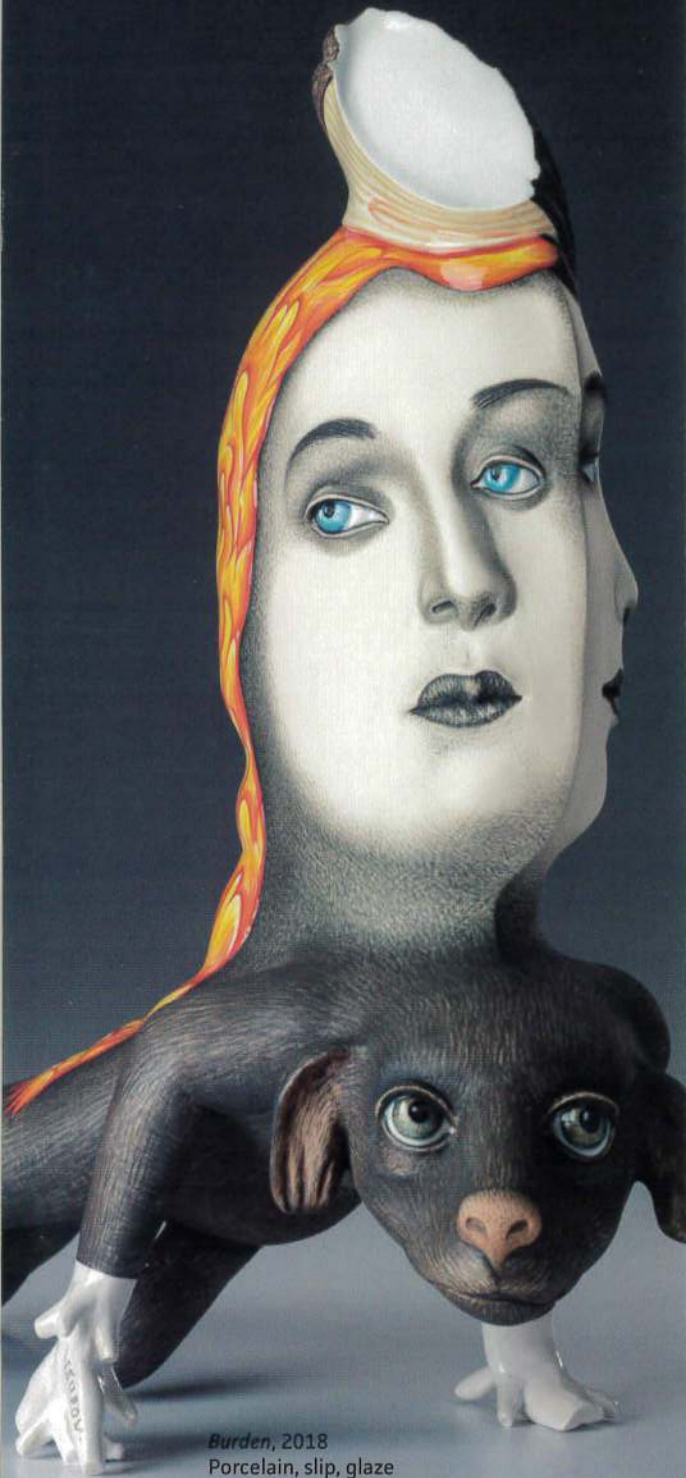
Burden , 2018 Porcelain, slip, glaze 14 x 13 x 6.5" Courtesy of Ferrin Contemporary and the artist