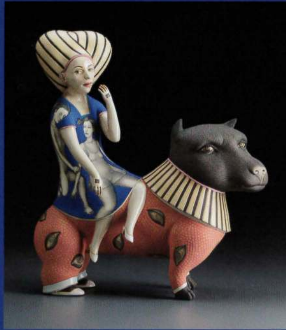
Life's Work , 2011 Porcelain, slip, glaze 16.875 x 14.75 x 5.5"

Artworks on display are on loan from Ferrin Contemporary and the artist. The Museum of Russian Art would like to thank Ferrin Contemporary and Sergei Isupov for partnering with the museum to make this exhibition possible.