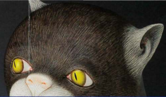
Close Your Eyes, Open Your Eyes , 2013 Porcelain, slip, glaze 16 x 11 x 7"

"My work portrays characters placed in situations that are drawn from my imagination but are based on my life experiences. My artworks capture a composite of fleeting moments, hand gestures, and eye movements that follow and reveal the sentiments expressed. These ideas drift and migrate throughout my work without direct regard to specific individuals, chronology, or geography."