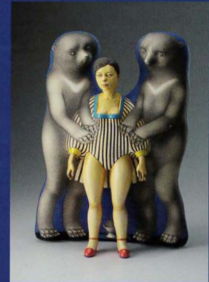
Free Ride , 2012 Porcelain, slip, glaze 20.5 x 14 x 6"